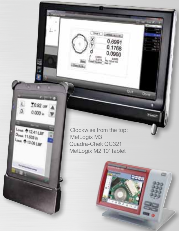
Clockwise from the top: MetLogix M3 Quadra-Chek QC321 MetLogix M2 10" tablet

QUADRA-CHEK QC321/ND1303 Digital Readout. All features of the QC221/ ND1203, but with a larger color touch-screen (8.4"). Supports CNC control and either optical edge detection or video edge detection