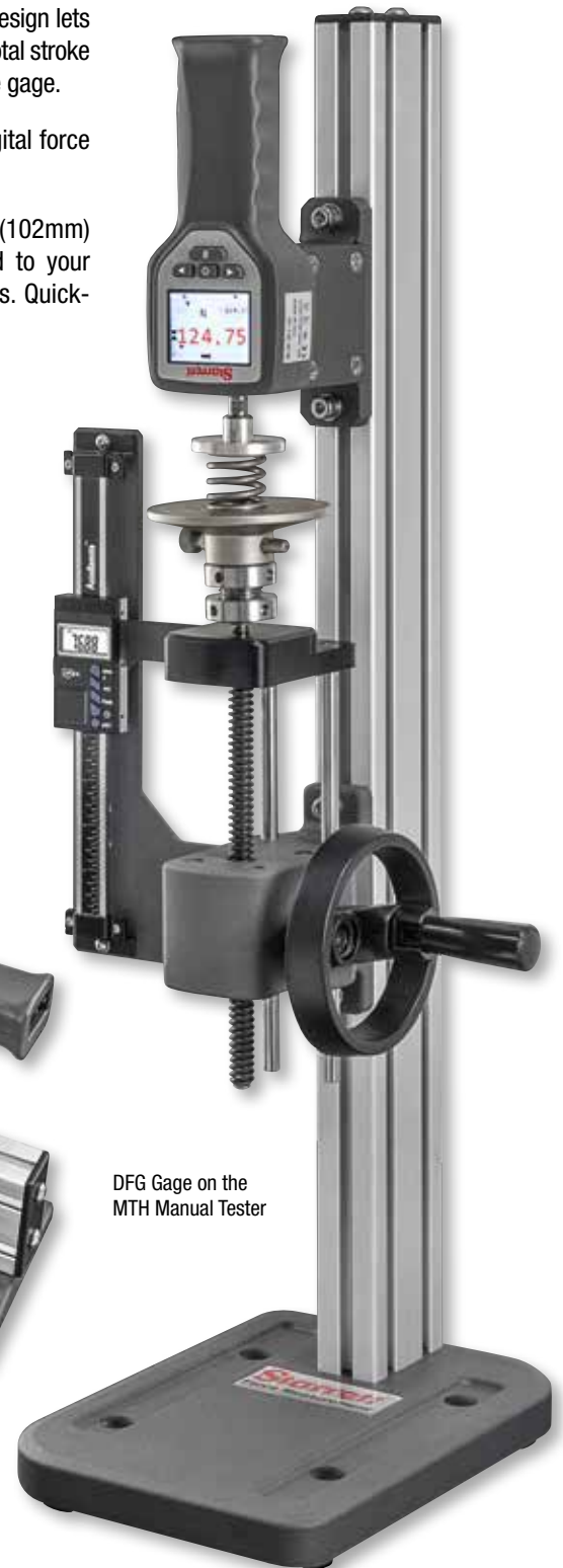
DFG Gage on the MTH Manual Tester