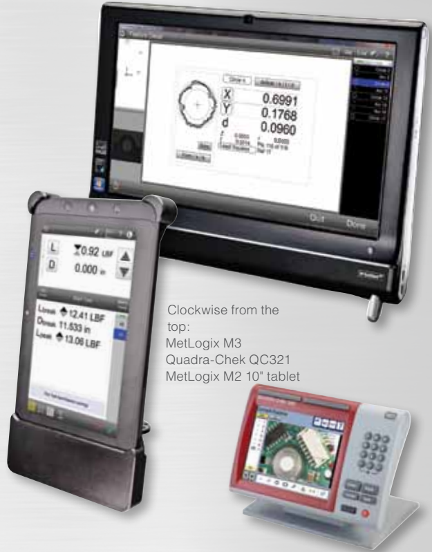
Clockwise from the top: MetLogix M3 MetLogix M2 tablet Quadra-Chek QC321

QUADRA-CHEK QC321/ND1303 Digital Readout. All features of the QC221/ ND1203, but with a larger color touch-screen (8.4"). Supports CNC control and either optical edge detection or video edge detection